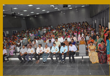
Faculty & Students