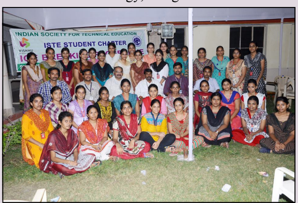
ICE Breaking program by ISTE Student chapter